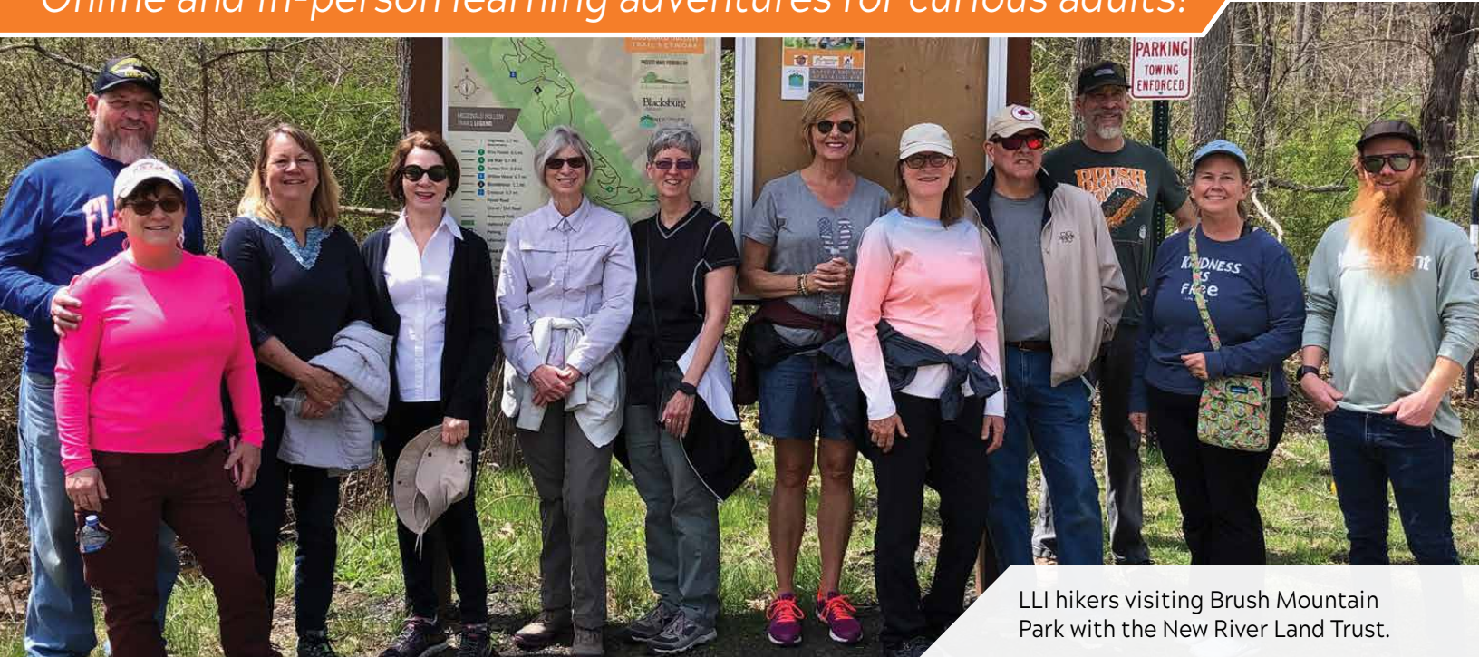
LLI hikers visiting Brush Mountain Park with the New River Land Trust.

Online and in-person learning adventures for curious adults!