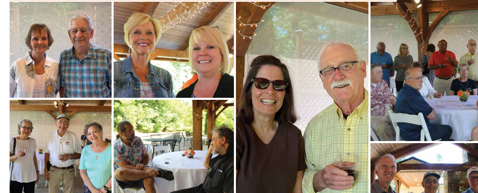
Front cover images: LLI Volunteer Appreciation Event, June 2021.