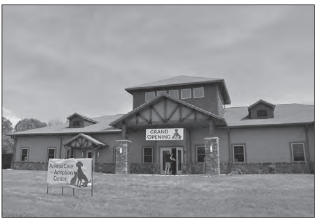
Montgomery County Animal Care and Adoption Center